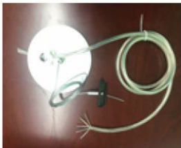
Hanging Kit includes canopy and power feed (A-HCPF606WH5W or A-HCPF612WH5W)