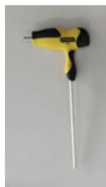
Joiner Tool (AIOCJOINERTOOL)