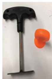
Lens Tool (AIOCLENSTOOL)

Dimensions and specifications subject to change without notice.