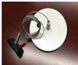
Non power feed side (A-HCNPF606WH or A-HCNPF612WH)