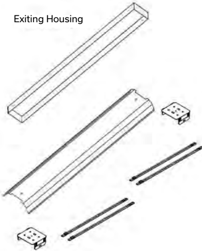
4ft. Retrofit Kit