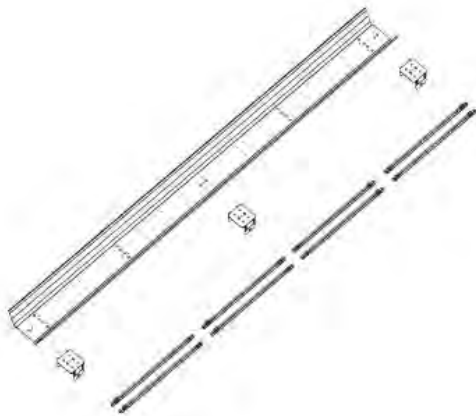
8ft. Retrofit Kit

All dimensions are inches. Specifications subject to change without notice.