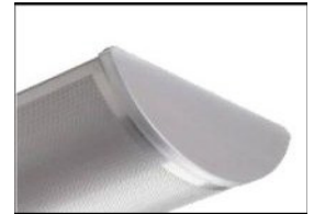
Available in brushed nickel (BN) or other custom finishes