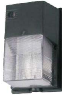
Square Unit MIMWPK