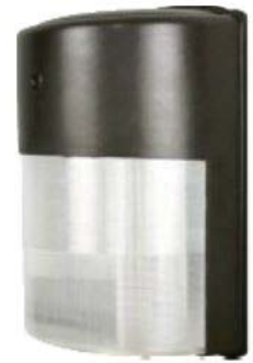
Round Unit MIMWPKRD