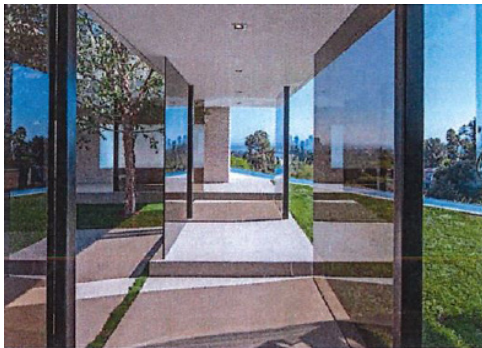
Since the CTCE Series are wet location rated and less than 15 watt, they are ideal for long, outdoor breezeways.